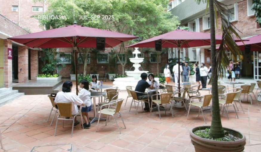
The courtyard at the former National Library on Stamford Road, 2004. Music performances, wellness talks and other cultural events were held there.

Between 1998 and its eventual demolition in 2005, it was used as a testbed for new ideas, many of which were later replicated in new libraries. These included a café, live music performances and talks on topics ranging from health to life sciences.