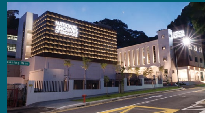
The National Archives of Singapore building at Canning Rise.

In 1997, the National Archives of Singapore moved into the former Anglo-Chinese Primary School building at 1 Canning Rise, where it remains to this day. Finally, in November 2012, the National Archives of Singapore became an institution of the National Library Board.