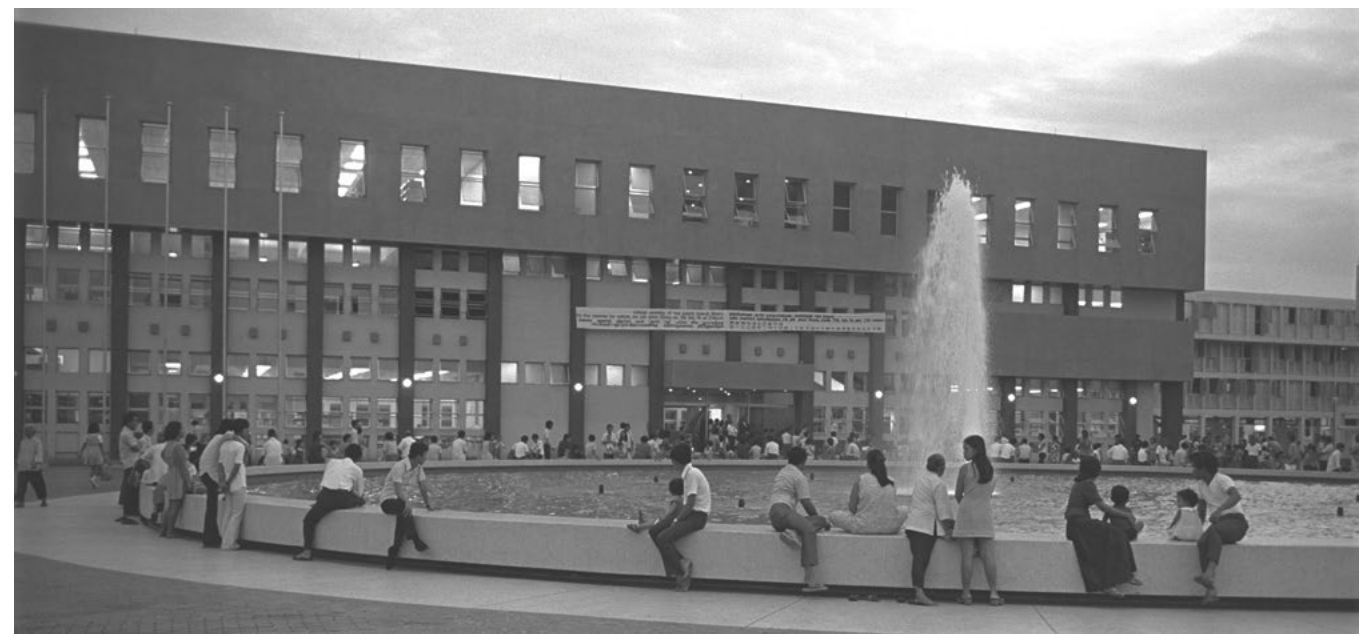
The round pool with a fountain in front of the Toa Payoh Branch Library, 1974.

A little over 50 years have passed since Toa Payoh Public Library opened its doors in 1974. Today, the building has become a landmark in the area. Built in what was then a young and growing town, the library is the second branch of the National Library after the first in Queenstown in 1970. 1 With its distinctive facade and location in the heart of Toa Payoh, the library has served generations of patrons.