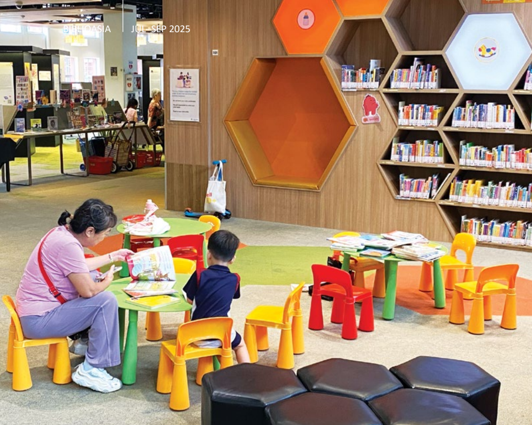
(Left) The children's section with the honeycomb design on the wall, ceiling and furniture, 2025.