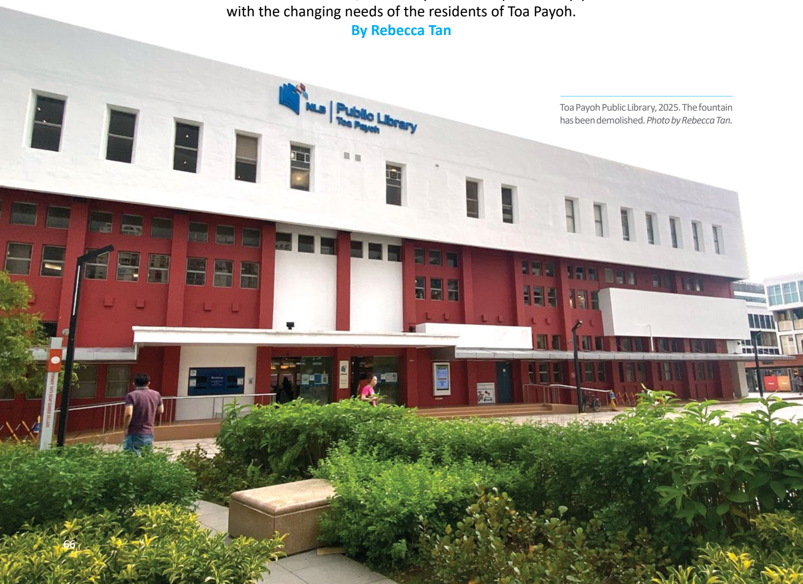
Toa Payoh Public Library, 2025. The fountain has been demolished.