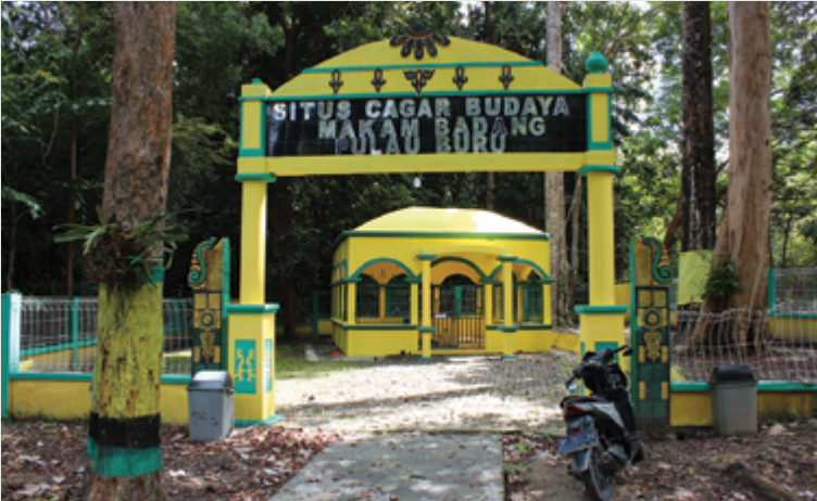
The grave believed to belong to Badang on Pulau Buru, December 2023. It is a long grave ( kubor panjang) measuring 3.25 m, a sign of divine power. The gaharu tree is to the left. The grave was declared an official cultural site in 2010.

Most versions of the Annals mention that Badang is buried in a place called Buru (بورو). Today, on Pulau Buru, a small island south of Pulau Karimun in the Riau Archipelago, there is a shrine above a makam , or grave, believed to belong to Badang. Located on a remote hill in an old rubber plantation, the grave was likely the location of a nature shrine before the associations with Badang were made.