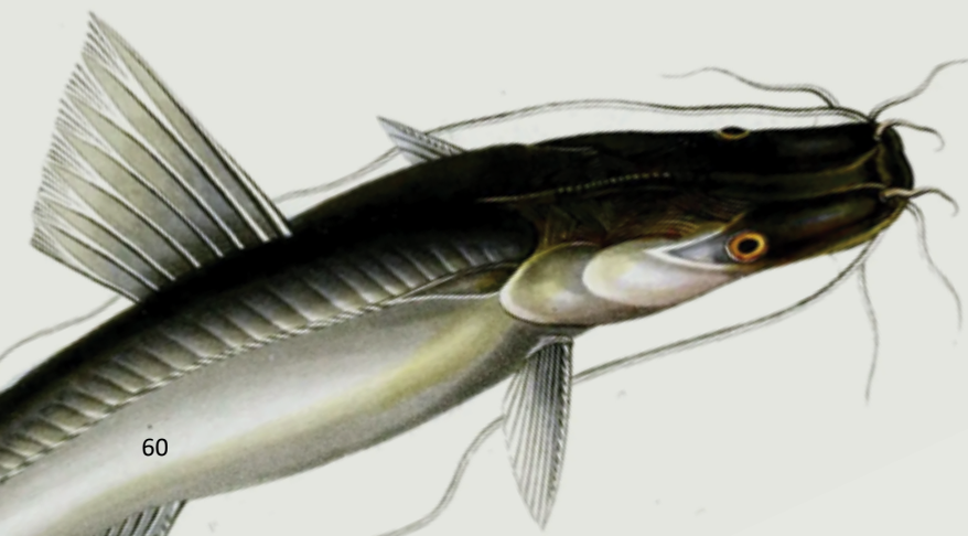
The singara, or catfish ( Sperata seenghala ). Image reproduced from W.H. Syxes, “On the Fishes of the Dukhun,” in Transactions of the Zoological Society of London (Vol. 2), 1841, Biodiversity Heritage Library .